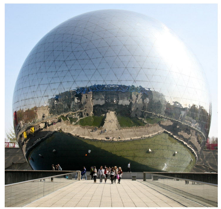
La Geode, Parc de la Villette, Paris.

iii. (2.5 pts) What is the minimal launching speed v_{\min} needed to hit the topmost point of a spherical building of radius R?