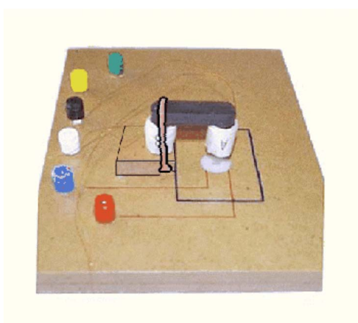
Figure 1: Experimental arrangement for part I.